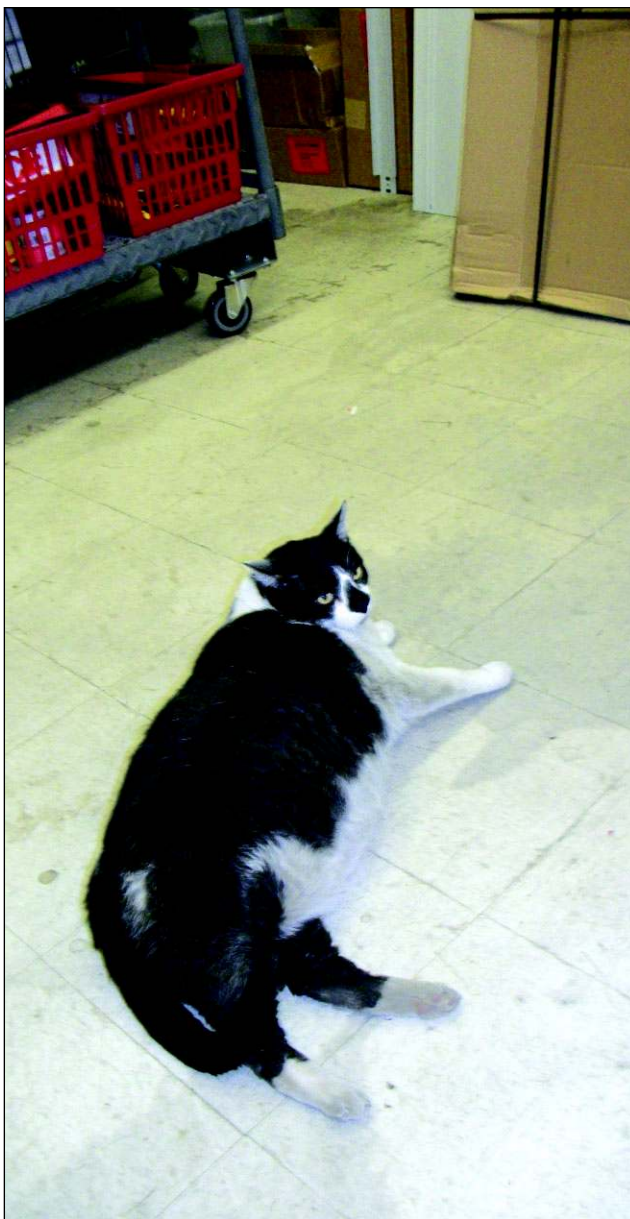
Hardware takes a break at Ace Hardware Northside.